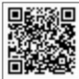
Title I: Employment