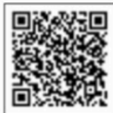
Title II: State & Local Government