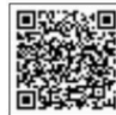
Title III: Public Accommodation

Provide options for the person requesting accommodations to choose the accommodations needed, such as the following: